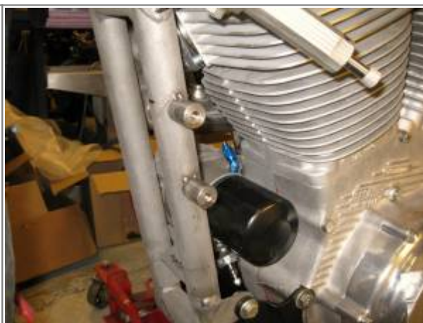
Die grinder used to put a curve in the end of a fabbed frame bung. 5)