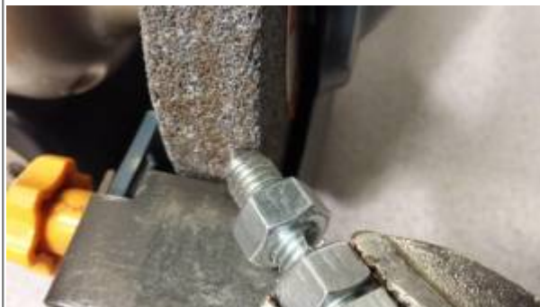
This is a safer way to do it. 3)