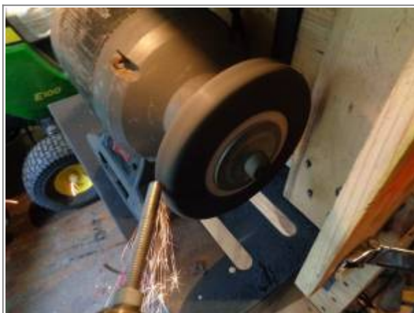
Rounding the end of a bolt 2)

A bench grinder is useful for making pointed or angled ends in round stock, screws and bolts. The bolt needs to be placed just below center of the grinding disc or it will buck above that.