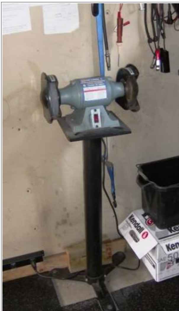
Pedestal mounted bench grinder 1)

Before using a bench grinder, make sure it is bolted down first. Otherwise it can catch the piece you're working on just wrong and jump out at you while spinning.