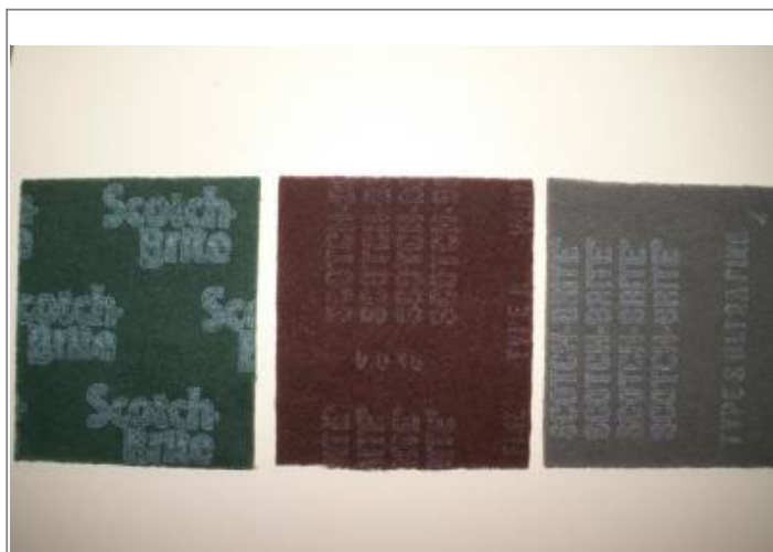
Scotch-Brite Grades 25)