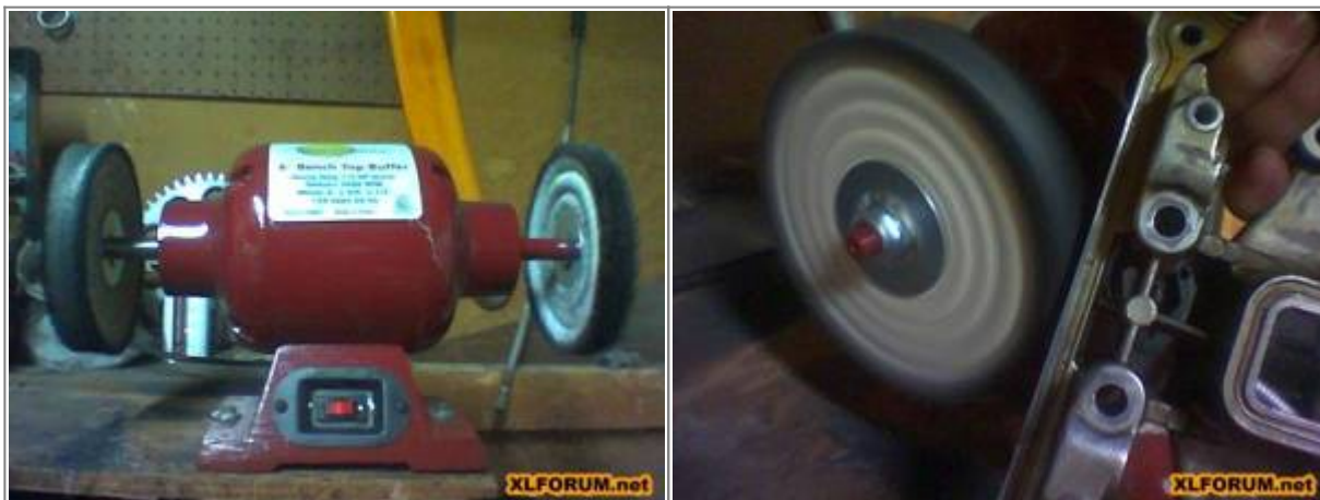
Polishing a rocker box top with a benchtop buffer 2) 3)

You can tell when you need to apply more from how clean the polish surface starts becoming. 1)