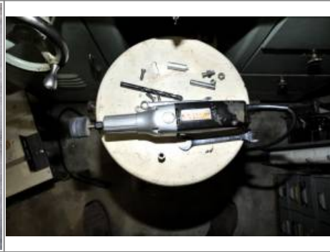
High speed grinder and hard felt wheel 10)