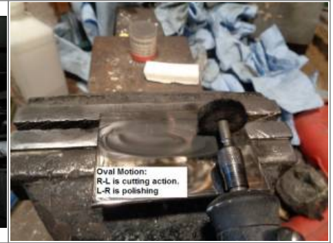
Dremil tool cut and polish action 11)