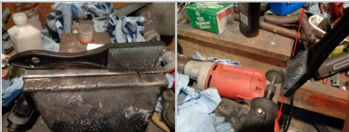
Wheel rake 23)

Loading too much polish on the wheel smudges and doesn't help you cut the metal. Pressing too hard while working also gathers and compresses polish into the wheel. Use this to unload excess polish and fine metal particles from the wheel and recondition the edge.