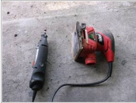
Dremil rotary tool and palm sander 9)

The 1" buffing bits will fit most places and the small 3/8" felt bullet shapes fit into most screw recesses. 8)