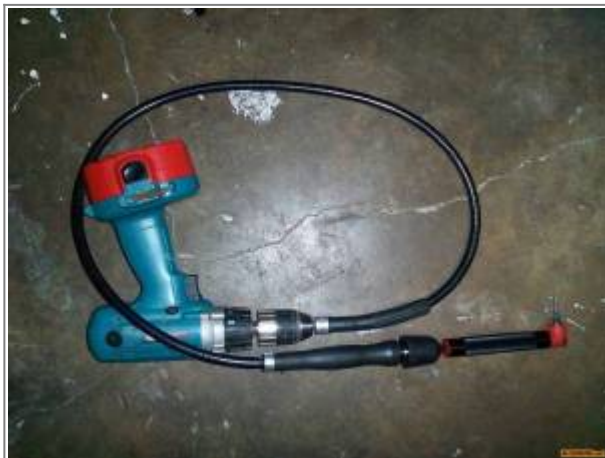
Flexible drill attachment 14)

A felt buffing pad works well (better than a thumb and wider than a dremel, so no little swirls). 13)