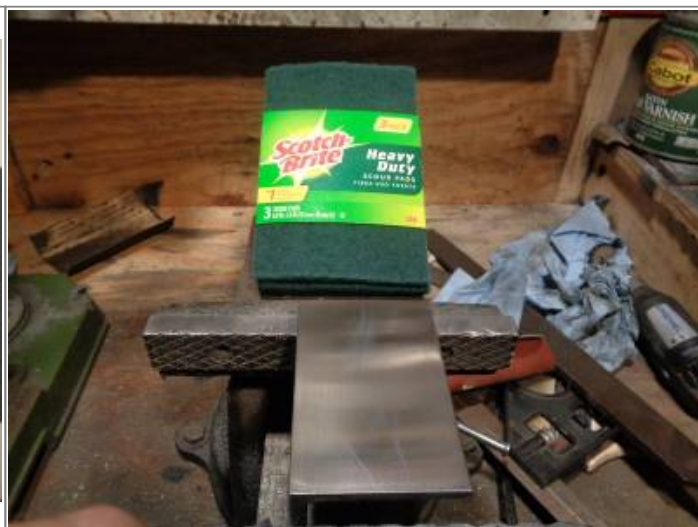
Heavy duty Scotch-Brite 26)

Here is a general chart with different Scotchbrite grades: