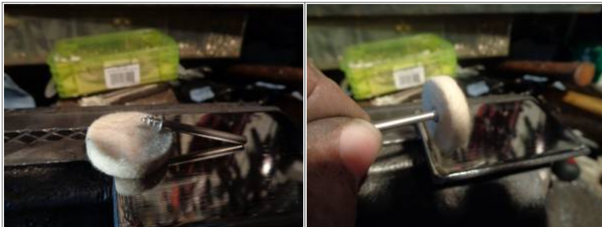
Dremil polishing pad mounted to a threaded shaft 16)

To help keep the pad from spinning off the shaft, you can mount it to a metal cutting wheel mandrel. Add a small washer over the attaching screw and snug it down against the pad. It doesn't have to be real tight.