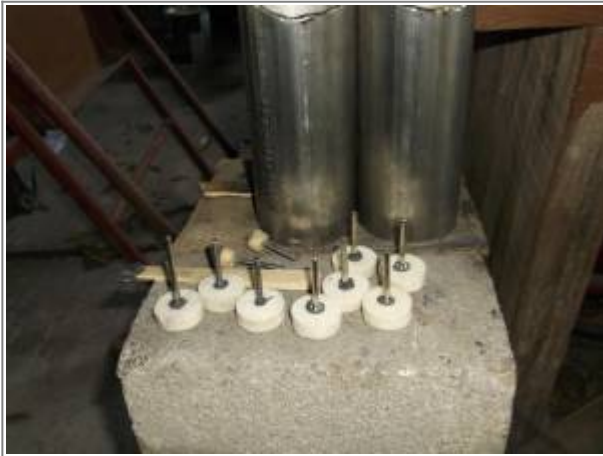
Polishing wheels for Dremil type tools 22)

Below are some wool polishing pads that were glued to mandrels. The larger ones are the 7/8" pads. They will last a very long time mounted with epoxy. But you need to let them cure over night before use for best results. The two smaller ones laying down behind them are 3/8" pads. They are good for getting in tight places. 21)