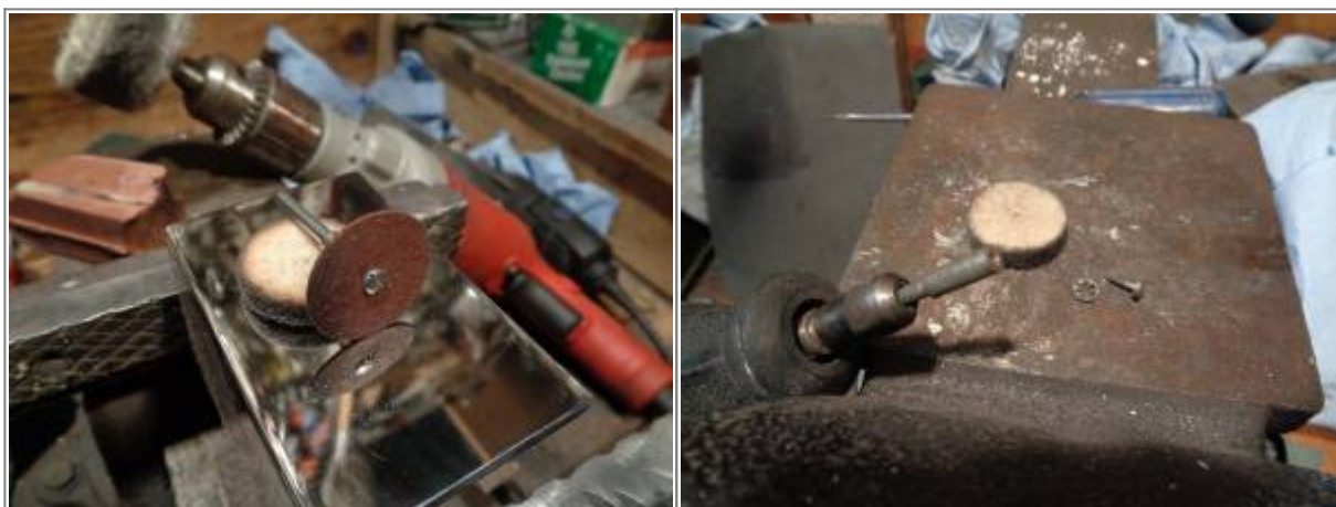
Dremil pad mounted to a cutting wheel mandrel 17)

To help keep the pad from spinning off the shaft, you can mount it to a metal cutting wheel mandrel. Add a small washer over the attaching screw and snug it down against the pad. It doesn't have to be real tight.