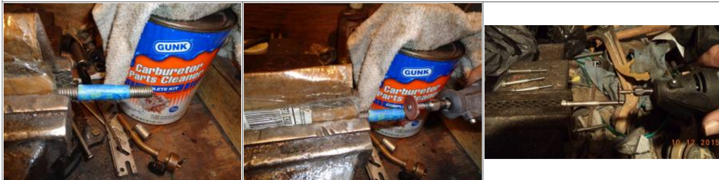
Shortening a bolt. 6)